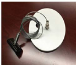
Non power feed side (A-HCNPF606WH or A-HCNPF612WH)