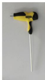
Joiner Tool (AIOCJOINERTOOL)