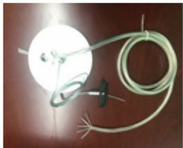
Hanging Kit includes canopy and power feed (A-HCPF606WH5W or A-HCPF612WH5W)