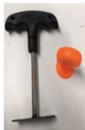
Lens Tool (AIOCLENSTOOL)

Dimensions and specifications subject to change without notice.